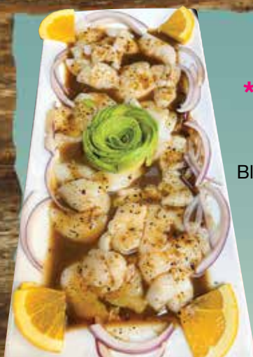
*AGUACHILE CALLO DE HACHA Black, Red, Green 19.99