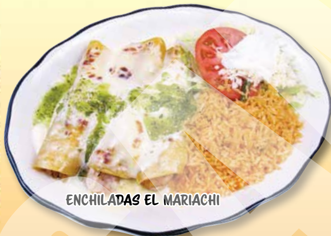
ENCHILADAS EL MARIACHI

Three enchiladas, one filled with chicken, one with ground beef and one cheese, covered with chipotle sauce. Served with rice, lettuce, sour cream and tomatoes. 11.99