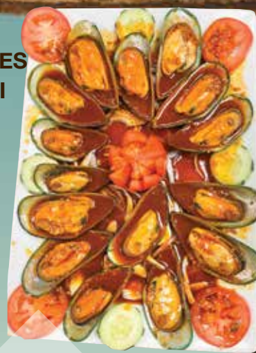
*MEJILLONES EL MARIACHI 19.99