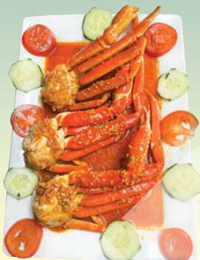
*CRAB LEGS EL MARIACHI 24.99