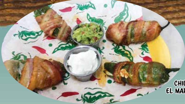
CHILES EL MARIACHI