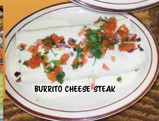
BURRITO CHEESE STEAK