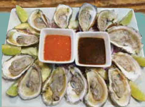
*OSTIONES NATURALES Served with sauce and limes. 18.99