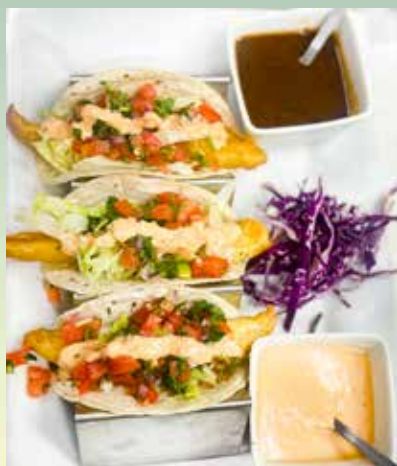
*TACOS CAPEADOS PESCADO O CAMARÓN Deep-fried tilapia fish served with cabbage mix, pico de gallo, fish sauce and cheese. 14.99