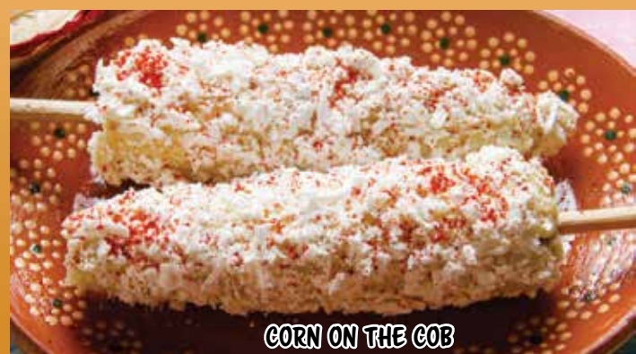
CORN ON THE COB